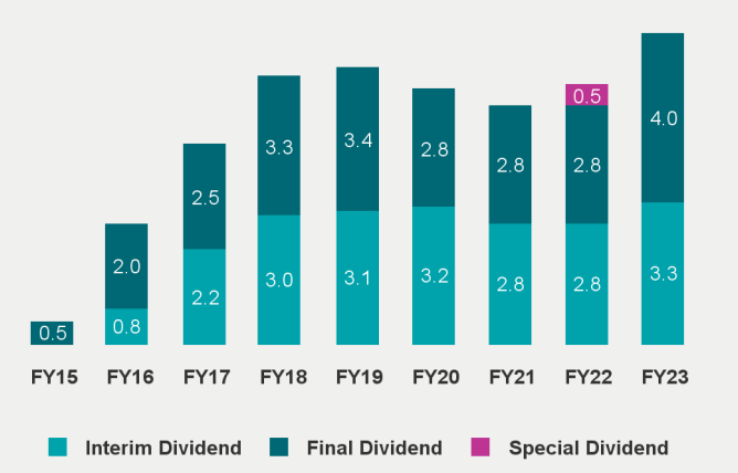
DIVIDENDS IN CENTS PER SHARE Annual dividend yield: 6.5% Grossed up annual dividend yield: 9.3%

Yield is calculated based on the total dividends of 7.3 cents per share and the closing share price of $1.125 as at 31 December 2023. Grossed up yield takes into account franking credits at a tax rate of 30%.